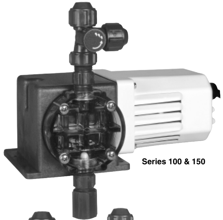
Series 100 & 150